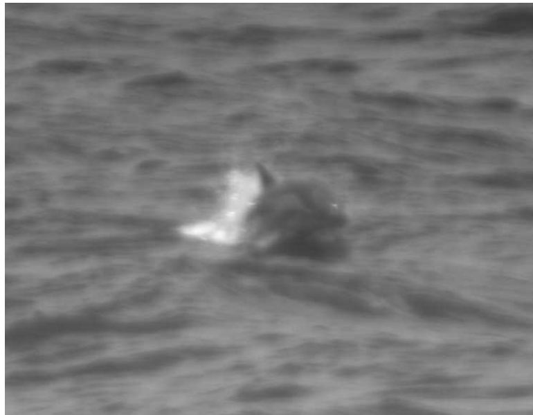
Figure 2 Top Panel: Radar-derived tracks of three detected stenella dolphins. Bottom Panel: Optical Image of a stenella dolphin during this sequence.

In one case, we were able to track a pod of three fin whales continuously for more than three hours. Separation of individual pod members was also demonstrated. In addition, rarer species such as Ziphius beaked whale and Risso's dolphin were also shown to be detectable. These results coupled with prior results achieved during Project Humpback [1] show the efficacy of radar-based surveillance technology as applied to the problem of detecting and tracking a broad class of marine mammals.