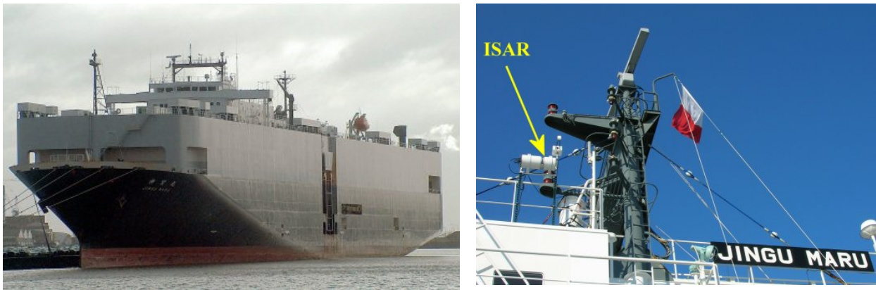
Figure 1. The NYK Ship Jungu Maru (left) and the location of the ISAR above the bridge (right).

times and locations of the measurements (determined by a GPS receiver integral to the ISAR) are used to determine the appropriate MODIS data granules for subsequent analysis. ISAR skin SST values are entered into the MODIS Match-up Data Base.