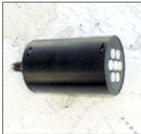
Fig. 2. The irradiance sensor being incorporated into Glider science bays in 2006.

oxygen levels are dynamic reflecting the relative interplay between the primary productivity in the euphotic zone and the relative efficiency of the export flux. Initial deployments will be conducted on the Endurance line off the coast of new jersey in late summer fall-autumn 2006.