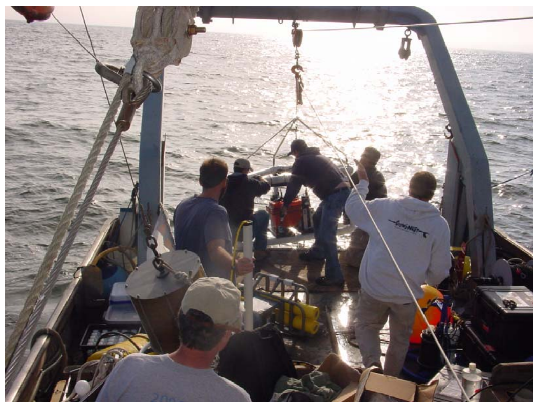
Figure 2. Scientists on the stern of the R/V Shana Rae recovering a battery-powered mooring that had been placed on the bottom in Monterey Bay for a 2 week time-period to test the performance of three different types of autonomous submersible chemical analyzers, including the APNA III.