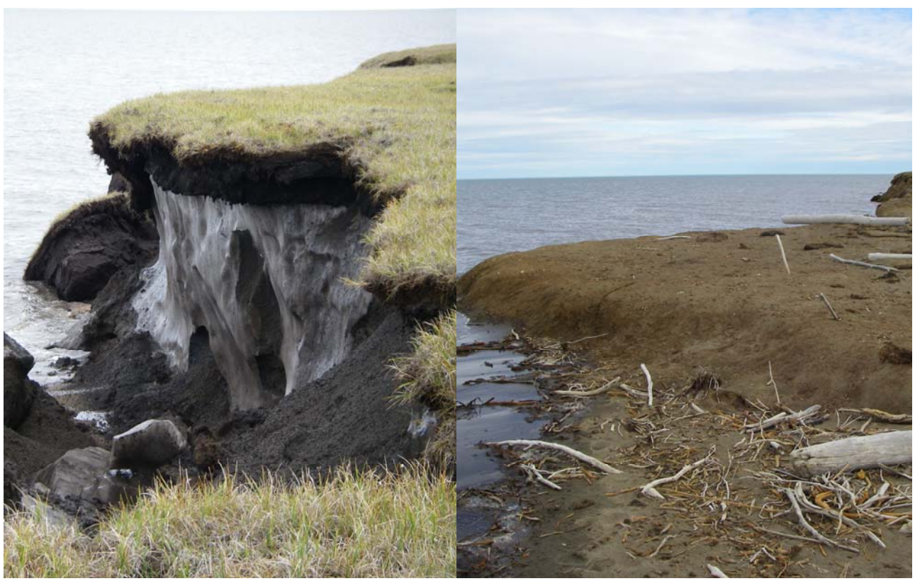
Figure 3. Coastal morphology in two endmember bluff substrates. Photo at left shows ice-rich coastal bluffs at Drew Point, with organic-rich mat overlying massive ground ice. Bluff height is approximately 2 meters. Photo at right shows the coast along the former shore of a drained thaw lake. Resistant organic mat here forms a promontory projecting into the Beaufort Sea. Both environments shown here are very poor in clastic material.

A final lesson learned from this reconnaissance field season was the observation that coastal bluffs along much of the Beaufort Sea coast between Drew Point and Cape Halkett are extremely poor in clastic material. In particular, many of the bluffs we visited are characterized only by massive ground ice overlain by a fine-grained organic mat (Figure 3a). This lack of clastic material suggests that the potential negative feedbacks on coastal erosion rates – buffering of the shore by local redeposition of clastic material – may be considerably weaker than we had anticipated. In addition, in many of sites we visited the coast is composed almost entirely of organic mats that formed the floors of thaw lakes that have since drained. These organic mats appear to be substantially more resistant to coastal retreat than adjacent portions of the shoreline (Figure 3b). As anticipated during the preparation of our proposal, along-shore spatial variations in bluff substrate composition may be extremely important in modulating the evolution of the coast itself.