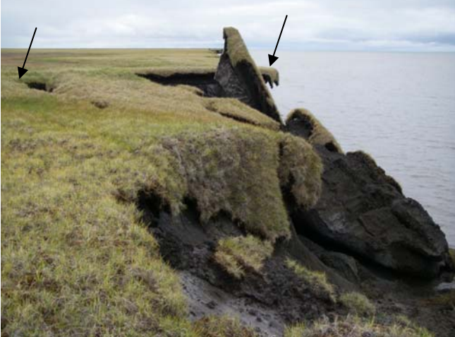
Figure 2. Two views of the Drew Point coastline. Left image: August 9, 2007. Right image: August 14, 2007. Note the substantial coastline change in the intervening period, during which time there were no significant storm events. Arrows point to the same features in both photos for reference.

One of our preliminary hypotheses when we designed this study was that inputs of warm freshwater from fluvial systems might be an important source of thermal energy to the coastal system. With this in mind, we had planned to monitor fluvial inputs by setting up a stream gauging station on the Ikpikpuk River. Two observations from our reconnaissance field season suggest that this will not be practical. First, after flying nearly the entire length of the Ikpikpuk River downstream of an existing USGS stream gauge, it is clear that there is not another suitable site for gauging this river; the river is sand-bedded and simply too dynamic to construct a reliable rating curve for any cross-section. In addition, our temperature measurements along the Beaufort Sea coast suggest that shallow coastal waters may reach high temperatures even in the absence of substantial freshwater inputs. Quantifying the thermal inputs to the coast from river systems may therefore be less important than monitoring and modeling direct solar radiative inputs to the shallow sea. We have revised our plans for Ikpikpuk gauging to include only a comprehensive thermal monitoring program, installing a number of selfcontained temperature sensors along the course of the river to monitor the downstream change in temperature as the river flows over the coastal plain. We will combine these data with discharge records from the USGS gauging station to estimate the total thermal inputs to Smith Bay.