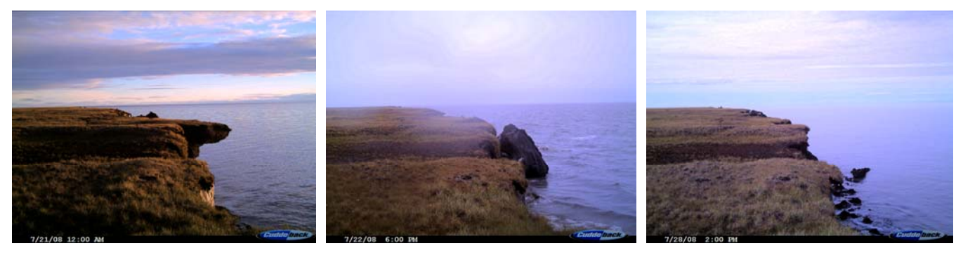
Figure 1. Three successive time-lapse photos collected on July 21st, July 22nd, and July 28th, showing the topple-failure and melting of a block of coastal bluff into the sea. Note that the entire process is complete within a week, and that no major storms occurred during this time period. Length of overhang in the first photo is approximately 2 meters.

The most influential datasets we obtained during our summer field work were three sets of time-lapse movies illustrating coastal erosion processes along the Beaufort sea coast and the shore of Lake 31. These images underscore the role that purely thermal erosion can play in undermining coastal bluffs, and illustrate how quickly the ice-rich blocks near Drew Point can be melted away once they topple into the sea. Figure 1 below shows three successive images from one of our time-lapse cameras at Drew Point. These images, and others like it, are helping to focus our thinking about the importance of discrete storm events vs. slow, steady disintegration of the coastal bluffs by thermal processes.