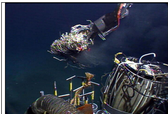
Figure 1. Carbonate / Tubeworm collection.