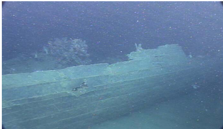
Figure 2. A view of the copper sheathing on the VK Wreck's port side hull.