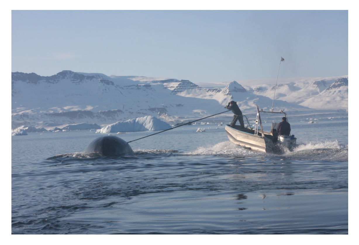
Figure 2. A bowhead whale in Disko Bay, West Greenland, May 2009, being instrumented with a satellite transmitter.

Our primary accomplishment for the second year of the project was the instrumentation of 44 whales with satellite tags between April and June in Disko Bay (Fig. 1), based on two field seasons, with three additional whale instrumented with a GPS dive tag that collected daily data for one month. Based on the satellite tracking data we found a clear spatial overlap during a several week period of bowhead and humpback whales in Disko Bay during the last half of May and early June. Whales explore several focal areas in the bay and during the period of temporal overlap, there is a clear spatial partitioning of the bay, with bowheads in northern coastal areas and humpback in southern coastal areas. Models are being developed quantifying this overlap. Furthermore, we have begun the initial stages of developing bioenergetic predation models based on the detailed dive data collected from GPS tags. The first step involves identifying U-shaped feeding dives and measuring the proportion of time spent on the bottom of each time together with velocity. We have identified over 13,000 U-shaped feeding dives on detailed dive data (combining all instruments deployed since 2002). Finally, information on zooplankton is being compiled into a manuscript that describes species diversity, densities and biomass found in Disko Bay. The plankton sampled in 2009 was mostly found concentrated in the upper 15 m of the water column and in one or two 10 - 40 m thick layers between 60 to 120 m depths.