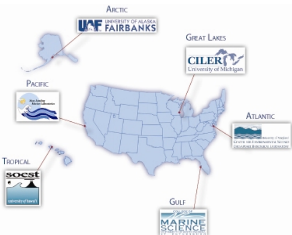
Figure 3. Current ACT Partner Institutions. Note that ACT Partnerships have been established with the institutions and not the individual Primary Investigators designated by the institutions.