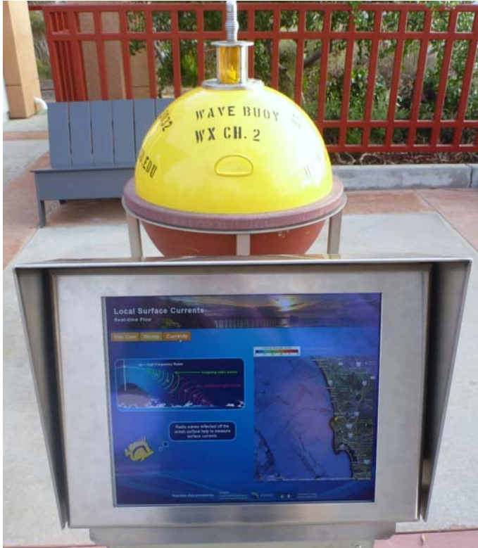
Figure 2. SCCOOS surface currents are featured on an interactive touch-screen kiosk at the Birch Aquarium as part of "Boundless Energy," an exhibit on sources of renewable ocean energy.