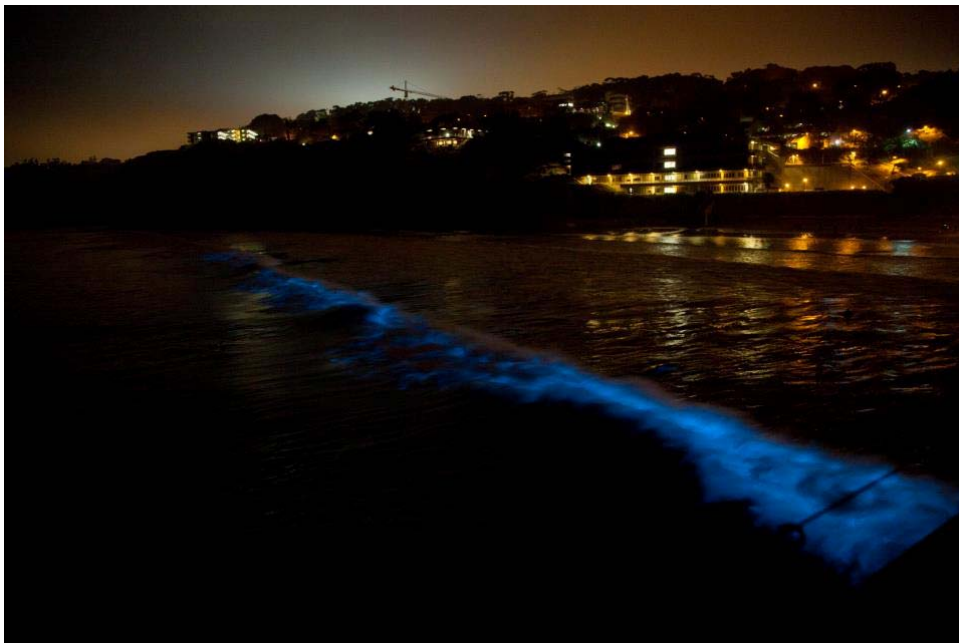
Figure 3. SCCOOS monitors harmful algal blooms (HABs) at six pier stations in Southern California. At the Scripps Pier, a “red tide” algal bloom of Lingulodinium polyedrum showed bright bioluminescence at night (Photo Credit: Christopher Wills, University of California, San Diego, September 2011).