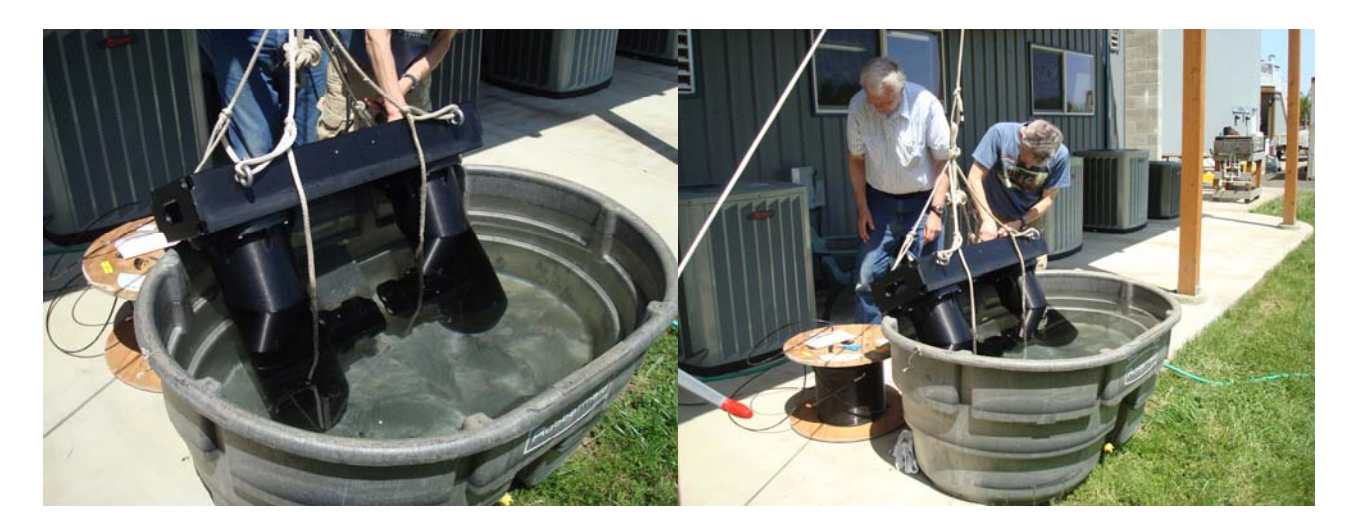
Figure 2. Submersion and system testing of the HOLOCAM at WET Labs.

The full mechanical build of the first in-situ HOLOCAM was completed at WET Labs. It has been pressure and submersion tested (Figure 2). Build of the second system is awaiting repairs to the second laser (see below).