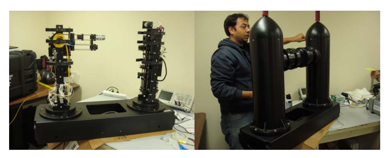
Figure 1. Internal electro-optical structure of the first in-situ HOLOCAM prototype (left panel). Pressure housings being assembled onto the HOLOCAM (right panel).

Project investigators and lead engineers have met numerous times to discuss the evolution of the HOLOCAM system design and control electronics. The primary focus of meetings have included overall mechanical design of the HOLOCAM, designing control systems for synchronous firing of laser and cameras, redesign and repackaging of laser power electronics, building flexibility into the optical layout of the holography system, data acquisition and storage system requirements, and optimizing the external housing design to minimize turbulence-shear in sample volumes. During this year, the system design was finalized and the build of the first in-situ system was completed (Figure 1). Additional build meetings were held with the group as the system was constructed to address any engineering issues and to bench-top test the prototype system.