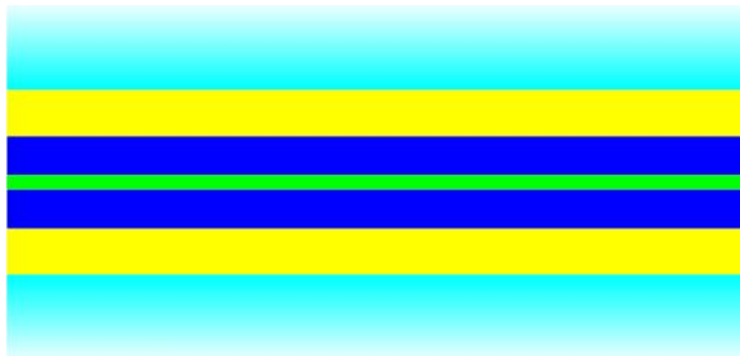
Figure 1. The concentric tube mass exchanger. The yellow is the Tygon tubing. The blue inside the Tygon tubing is the sea water. The green is the Teflon tubing with the HPTS dye solution inside.

Although the previous mass exchanger had the benefits of being impermeable to CO 2 exchange from the outside and showed mixed plug flow properties from a residence time distribution, it did not meet the size specifications required for deployment. To this end, a concentric tube mass exchanger shown in Figure 1 has been developed. The same Teflon 2400 capillary tubing (0.032" OD and 0.024" ID) was used as our exchange membrane tubing (again due to its exceptional gas permeability), with Tygon gas proof tubing on the outside. The length of the membrane has been cut in order to accommodate the slightly slower Dolomite pump used.