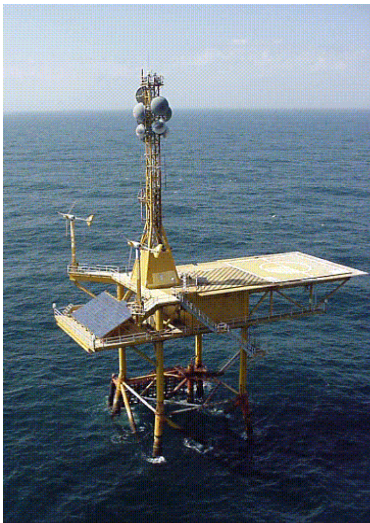
Figure 1. The M2R6 platform. This “master” platform is located in 33 m water depth about 60 km offshore. Power on the master platform is generated on site by photovoltaic panels, wind generators and a diesel backup generator. A high-bandwidth microwave network is used for communications between master platforms and shore. Helicopter transportation of personnel is used for most servicing operations.

packages, and, where possible, to make instrument packages serviceable from the platform (minimizing the need for weather-dependent ship and diving operations).